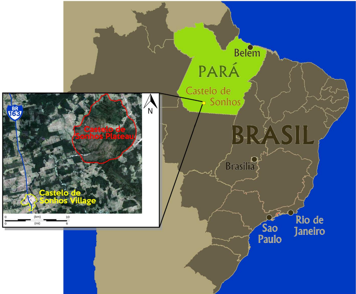
Figure 1: Location of CDS in Para State in Brazil

The existing infrastructure for CDS is considered excellent for a developmental project, specifically